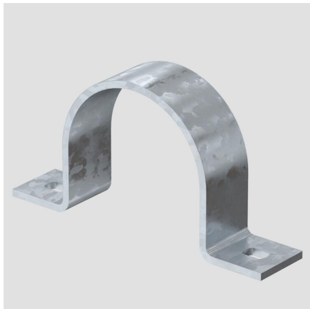
Fastening clip, double-lobe, 63 mm